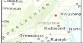
Figure 3 Offsite Substation Option 2 - Overview Blackwell Road 230 kV Transmission Line and Substation Project Fauquier County, Virginia